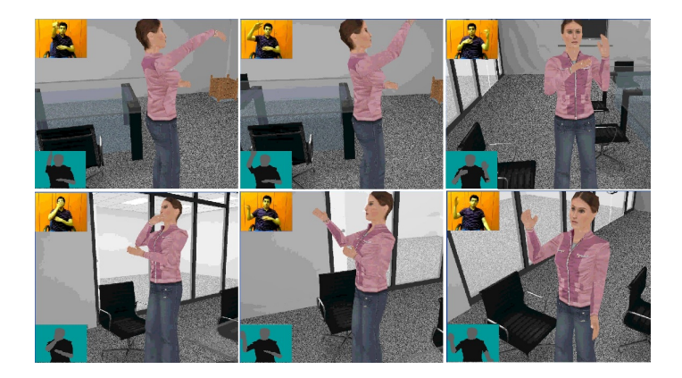
Fig. 3. Real-time 3D motion capture by computer vision and virtual rendering. For each captured image (top left inlays), the 3D model is projected with the pose that best matches the primitives (bottom left inlays). The virtual avatar (OpenSpace3D [11]) renders the captured gestures.